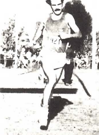
ABOVE: The field is sent away in the A.C.I. Bacchus run. BELOW: Robert de Castella is first home.