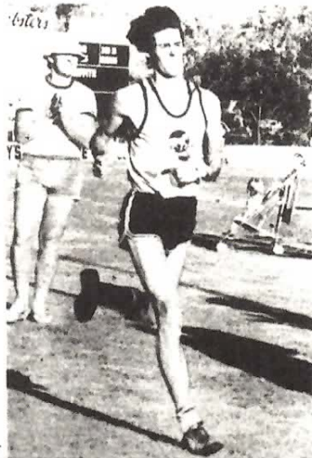
Steve Austin comes in to win.