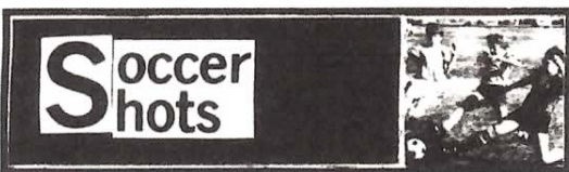
The Junior Soccer competition will be commencing tomorrow.